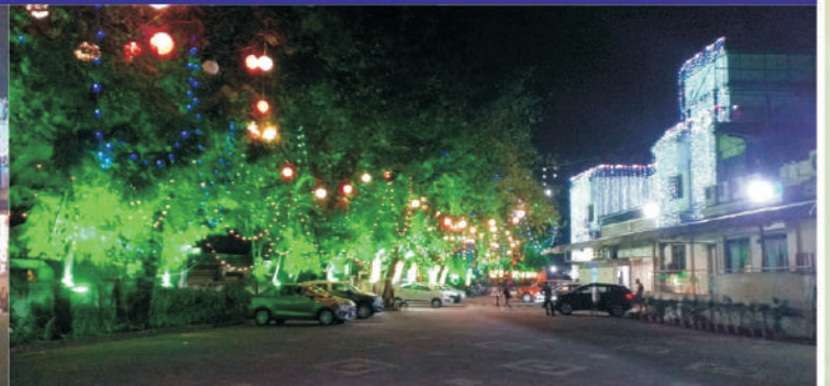
DIWALI LIGHTINGS - 2020