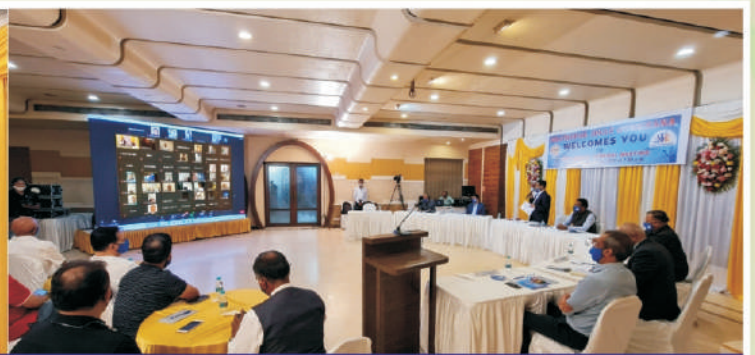
35TH VIRTUAL AGM HELD ON 22ND DECEMBER, 2020