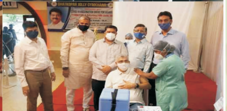
GHATKOPAR JOLLY GYMKHANA COVID-19 VACCINATION DRIVE FOR MEMBERS HELD ON 11th & 12th JUNE, 2021