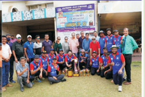
JPL T-10 CRICKET TOURNAMENT HELD ON 20TH, 21ST, 27TH & 28TH MARCH 2021