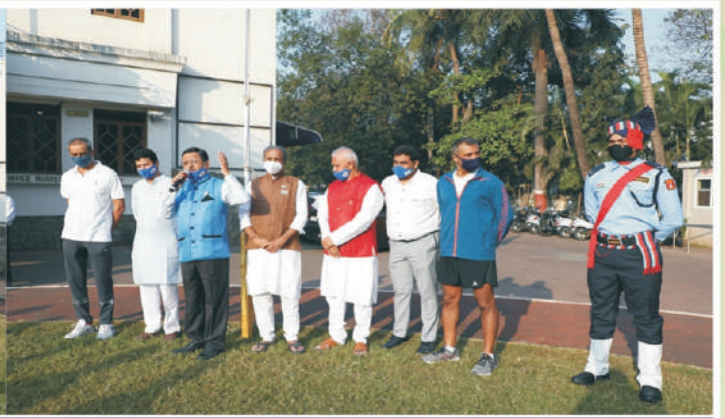
Flag Hoisting Ceremony held on 26th January, 2021