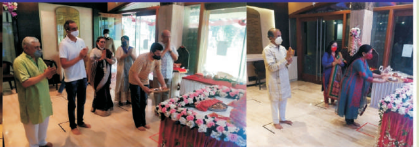
NAVRATRI AARTI HELD FROM 17TH - 25TH OCTOBER, 2020