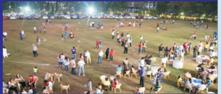
Kite Festival held on 12 th January, 2020.