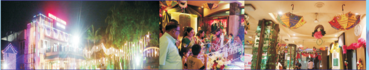
Diwali Lightings on Occasion of Diwali Festival, 2019