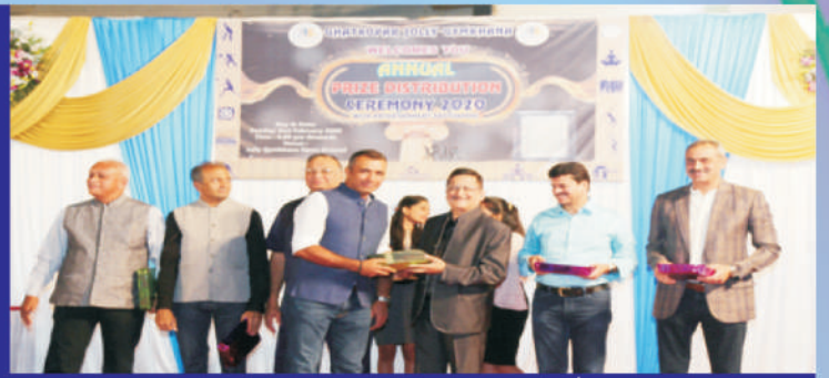
Annual Prize Distribution Ceremony held on 2 nd February, 2020