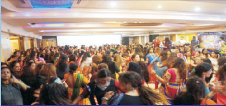
Dandiya Raas held on 29 th September - 08 th October, 2019