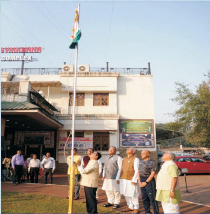
Flag Hoisting Ceremony held on 26 th January, 2020