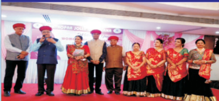
Women's Day Finale Celebration (Sports & Talent) held on 6 th March, 2020