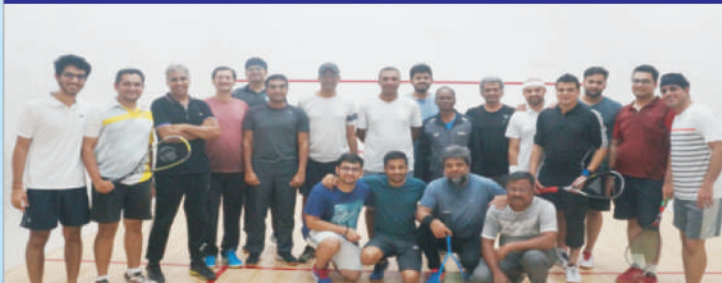
Squash Tournament held on 30 th November, 2019