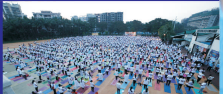
Surya Namaskar held on 15 th December, 2019