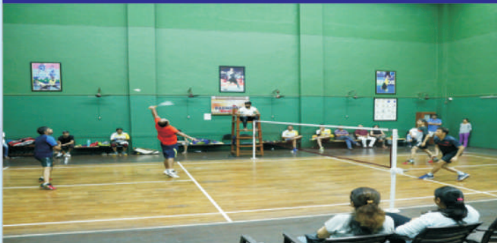
Badminton Tournament held on 10 th November, 2019