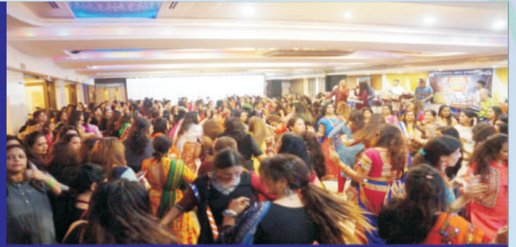
Ladies Raas Garba held on 12 th October, 2019