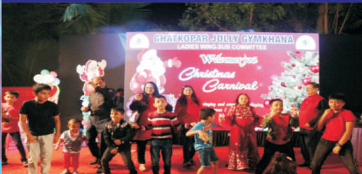
Santa's Carnival Festival held on 25 th December, 2019