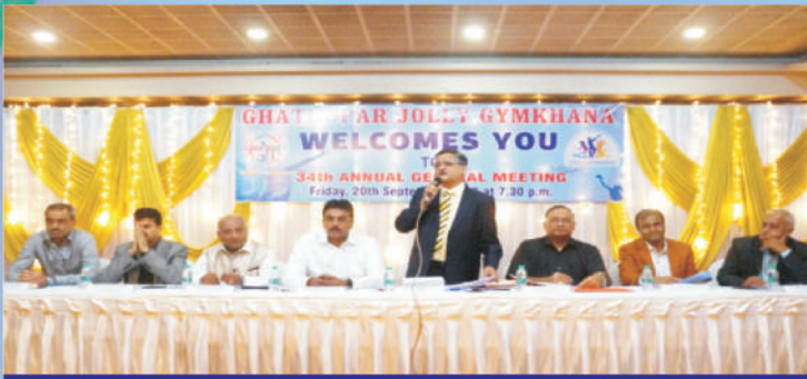
34 th AGM held on 26 th September, 2019