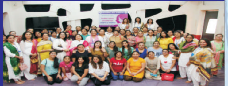
Women's Day Celebration (Sports & Talent) held on 1 st - 6 th March, 2020