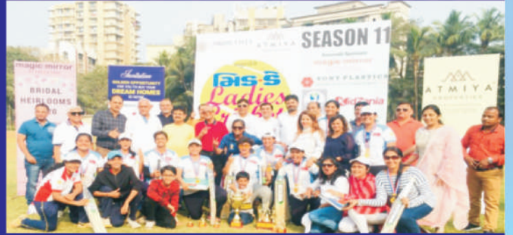
Mumbai Level Ladies Cricket Winner team Jolly Gymkhana, Tournament held on 10 th - 12 th January, 2020