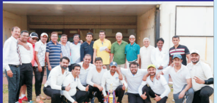
Annual Tennis Cricket Tournament held on 19 th & 26 th January, 2020