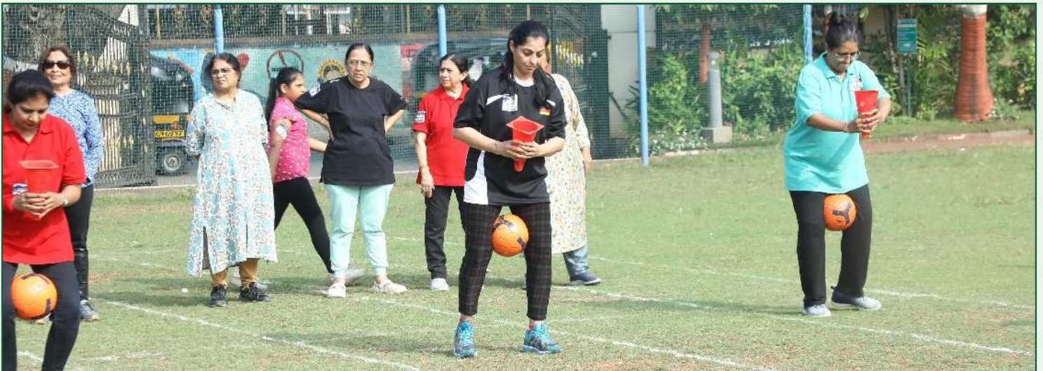
Sports Day Event on Sunday, 7th January, 2024 was organized by Ladies Wing Sub-Committee on open ground for Women and Children. We got an enthusiastic response from all members, as total 265 members had participated in 700 plus different sports categories.