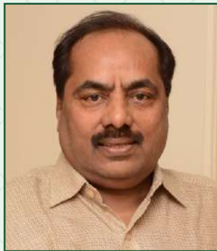
DILIP A MEHTA