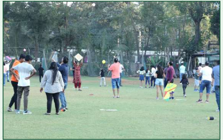
On the occasion of Makar Sankranti, Kite festival was organized in open ground on Sunday, 14th January, 2024. 250 plus members came together along with their family and witnessed vibrant and different shapes kites flying.