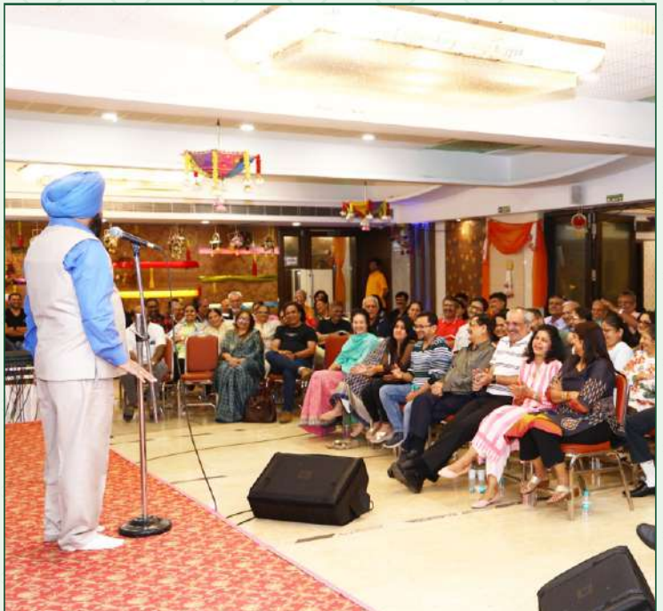
Akhil Bhartiya Virat Hasya Kavi Sammelan was organised by Events & Entertainment Sub-Committee on Friday, 27th October, 2023 which was attended by 292 Members and 52 Members Guest.