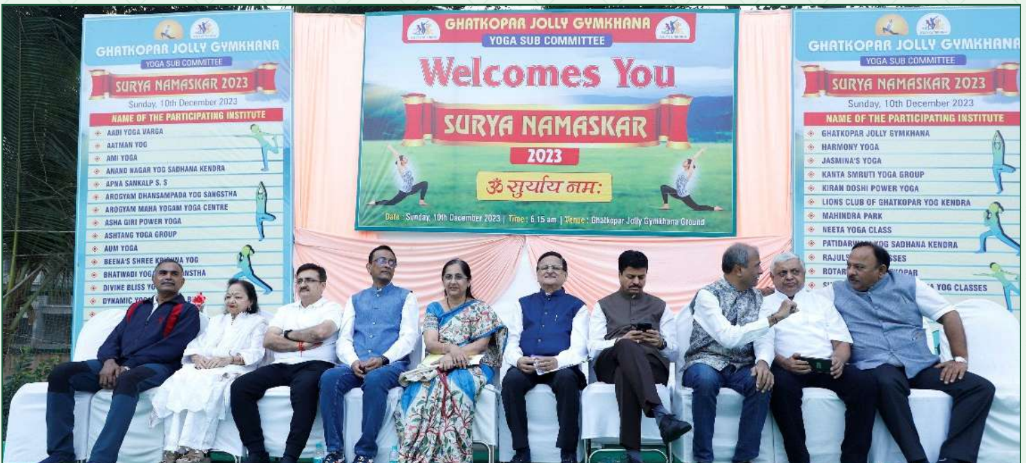
Yoga is an ancient practice that involves physical poses, concentration and deep breathing. It is both spiritual and physical. Yoga Sub-Committee of Ghatkopar Jolly Gymkhana had organized Surya Namaskar 108 rounds / 60 rounds event on Sunday, 10th December, 2023 on Ground to promote Yoga in all communities. We got a spontaneous response from Mumbai Suburb, Thane and Kalyan, as the total 1800 plus Yogik (including senior citizens) from 50 Institutes had participated and grace the event with 108/60 Surya Namaskar.