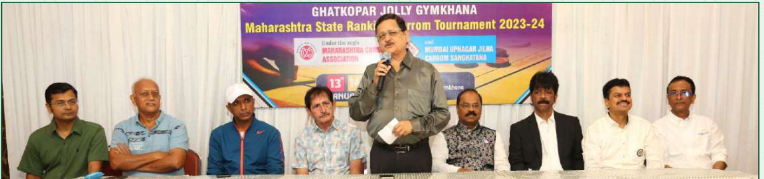
1st Ghatkopar Jolly Gymkhana Maharashtra State Ranking Carrom Tournament under the aegis of Maharashtra Carrom Association held from 13th to 15th January, 2024 where in participation was of 275+.