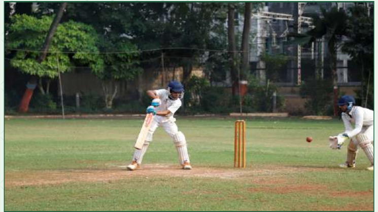
Cricket Sub-Committee organised Inter School Cricket Tournament 2023 from 02nd to 13th December, 2023. Total Eight Renowned Schools from Mumbai participated and enjoyed the matches. Final Match was won by Pawar Public School, Bhandup and Runner-up Team Swami Vivekananda School, Chembur. Prize Distribution was done on the same day.