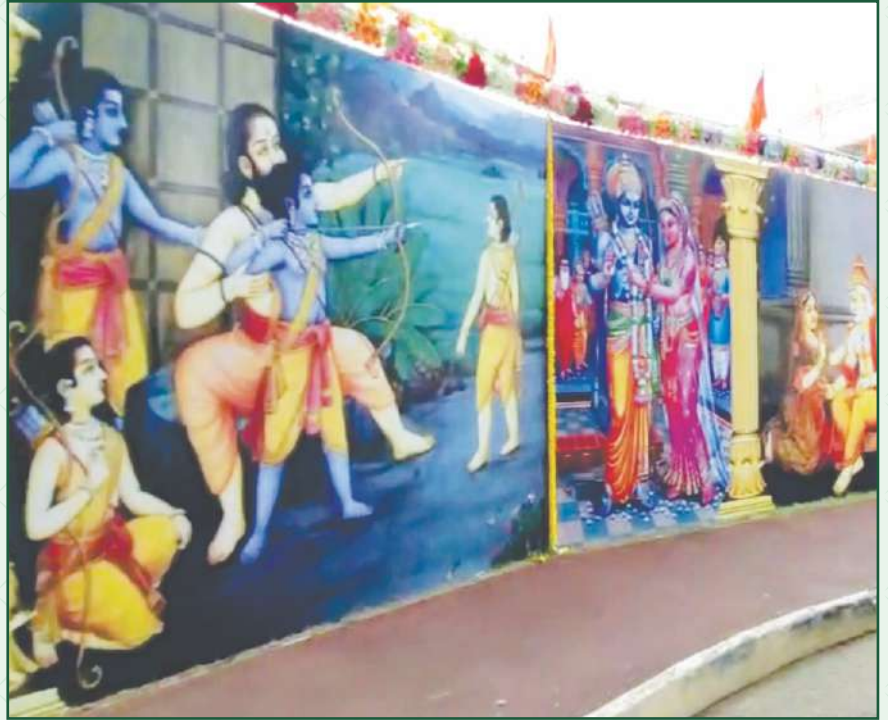
Ghatkopar Jolly Gymkhana was decorated for 6 days from 21st to 26th January, 2024 on the occasion of SHRI RAM PRAN PRATISTHA at Ayodhya on 22nd January, 2024. there were Rangoli, Lightings, Diya, Big Posters etc.