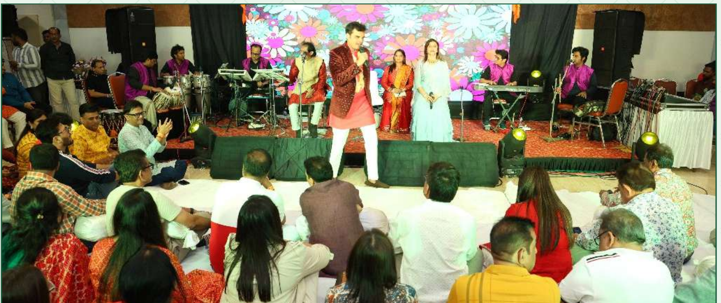
Gujarati Geeto No Guldasto Ranglo was organised by Events & Entertainment committee on Sunday , 21st January, 2024 where in 481 members & guest enjoyed the event.