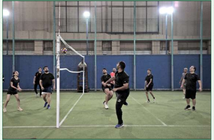
Annual Volleyball Tournament 2024 conducted on Saturday 6th & Sunday 7th January, 2024 by Multi Turf Sub-Committee where in 90+ members participated